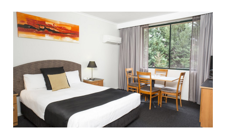
Range of Room Types